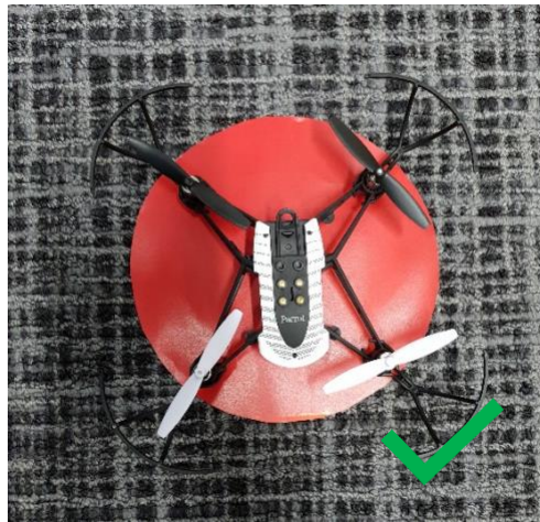
Complete minidrone landing on the circle