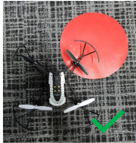
A part of minidrone landing on the circle