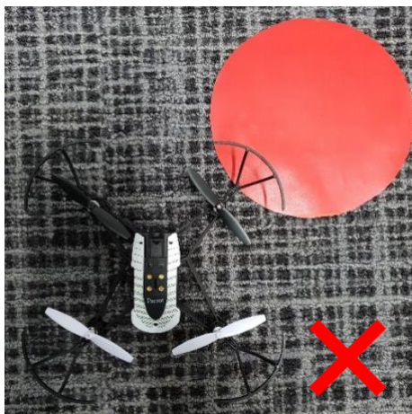
Minidrone's bumper hovering over the circle