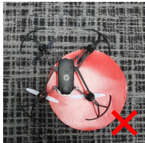
Minidrone landing upside down on the circle